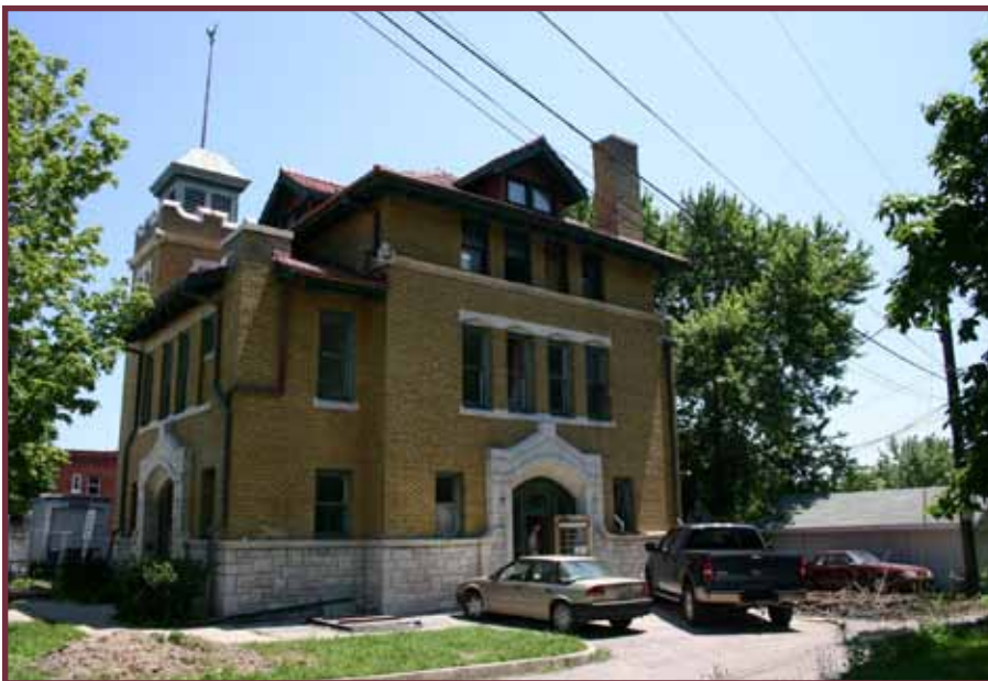
Fire Station #9, Kansas City, Kansas

3) In short, the full economic and tax benefits from the KHTC are yet greater than the already considerable economic and tax consequences documented in the current study.