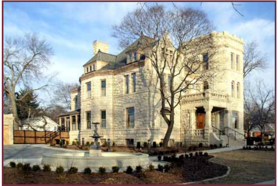
Castle Tea Room, Lawrence, Kansas

While the KHTC is geographically dispersed in Kansas, locations where